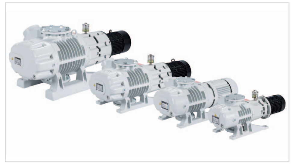
Range of RUVAC pumps: WAU 2001, WAU 1001, WSU 501, WAU 251

Each series consists of various sizes to always provide an optimized pumping speed for each application. All three series are available with or without integrated bypass valve (also known as pressure compensation valve).