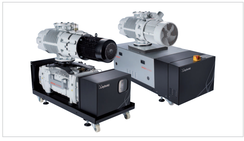
DRYVAC SYSTEMS: Modulare Standard-Vakuumsysteme für unterschiedlichste Anwendungen - kurzfristig lieferbar

Typical applications are heat treatment, furnaces, metallurgy or large area coating.